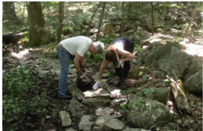
Volunteers building a stone walkway in Highland Forest