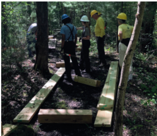
Volunteers building a boardwalk in Jericho Forest