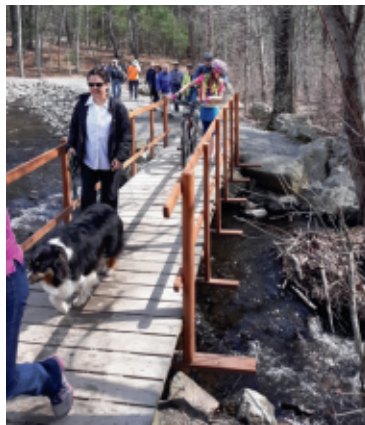
New railings on Hobbs Brook Bridge