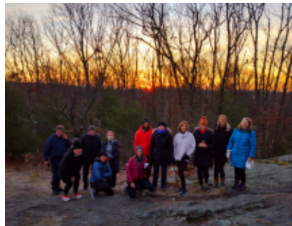
Winter Solstice Dawn Walk