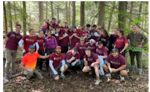
Regis College Work Crew