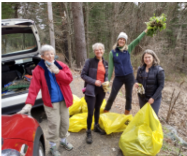
Sunset Corner Cleanup