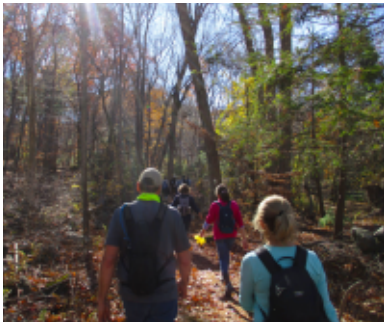
Cross Weston Walk

A cross-Weston trail walk was held on October 30 when 20 hikers walked from the Lincoln border down to the Wellesley border, covering 9.5 miles in about 3½ hours. In addition, a winter solstice hike was held at Cat Rock Park where hikers enjoyed a cold sunrise. Future plans include a Wayland to Waltham walk, an aqueduct walk, and more solstice hikes.