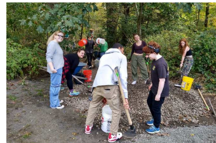
Community Service Day: Cambridge School of Weston