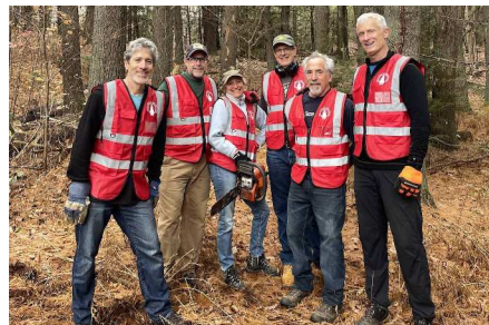
Red Vests taking a break

Taking care of the trails should be on every trail user’s mind. If you see trash, pick it up. If your dog leaves a mess, clean it up and bring the poop bags home for disposal. Everyone contributes to the beauty of Weston’s trails, and everyone knows how to leave no trace.