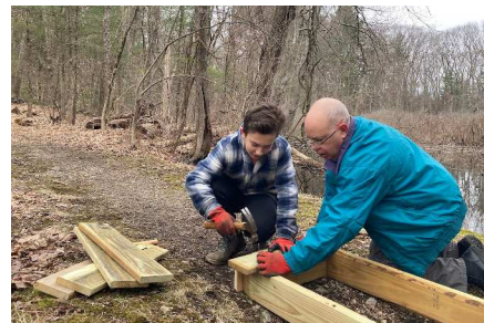
Building new bridges